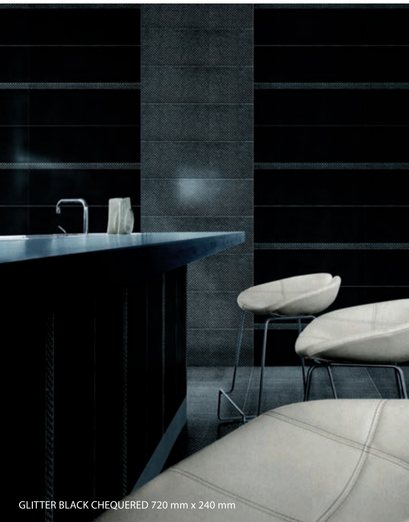
GLITTER BLACK CHEQUERED 720 mm x 240 mm